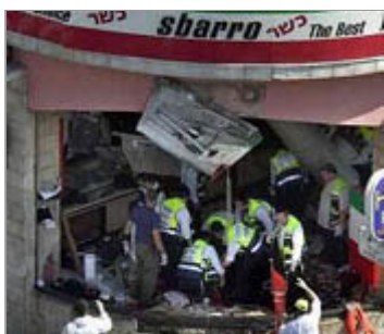
What Barghouti's guitar did: 17 dead, more than 100 injured.