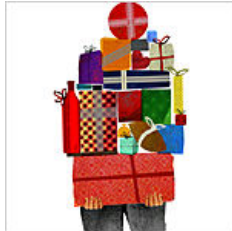
The Sweater Only a Mom (and Analyst) Could Love