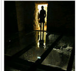
House Tour Sheds Light on Life in Old Rome

Home | World | U.S. | N.Y. / Region | Business | Technology | Science | Health | Sports | Opinion | Arts | Style | Travel | Jobs | Real Estate | Autos | Back to Top