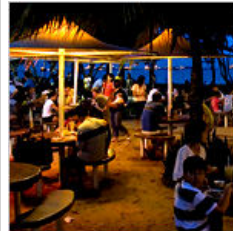
36 Hours in Singapore