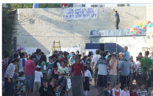
At the Ezra Bazaar

perform for the children and their families. Bouncing castles, arts and crafts stalls, a petting corner, and the opportunity to donate blood via a